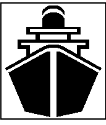
One Day Event

Come and Take a cruise Lots of Food Just Fun in the Sun